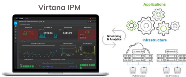
Figure 1: Single pane of glass view of compute assets onpremise and in the public cloud.

Virtana IPM WisdomPack for Enterprise Storage is a key building block of your full-stack infrastructure monitoring and analytics platform.