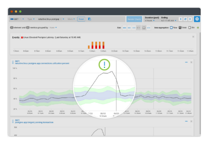
Figure 6 – A dashboard metric widget using CloudWisdom's anomaly detection capability.

The expected behavior is called a contextual band, and when using Virtana's monitoring dashboards it can be seen as the thick blue line on a metric widget.